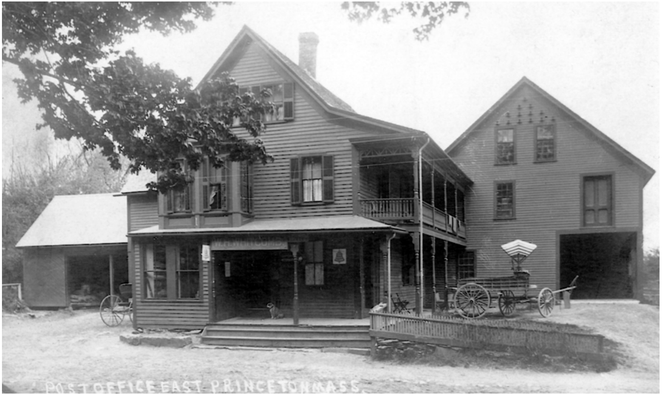
Whitcomb Post Office, Store and Gas – 78 Main St.