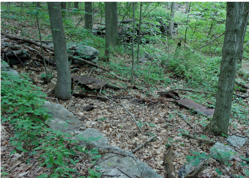
View From the East circa: 1880 of All Three Locations (Before Grand View's Major Expansion and After the Mountain House Expansion)

To the left, Today's View of the Mountain House Foundation Off Mountain House Trail