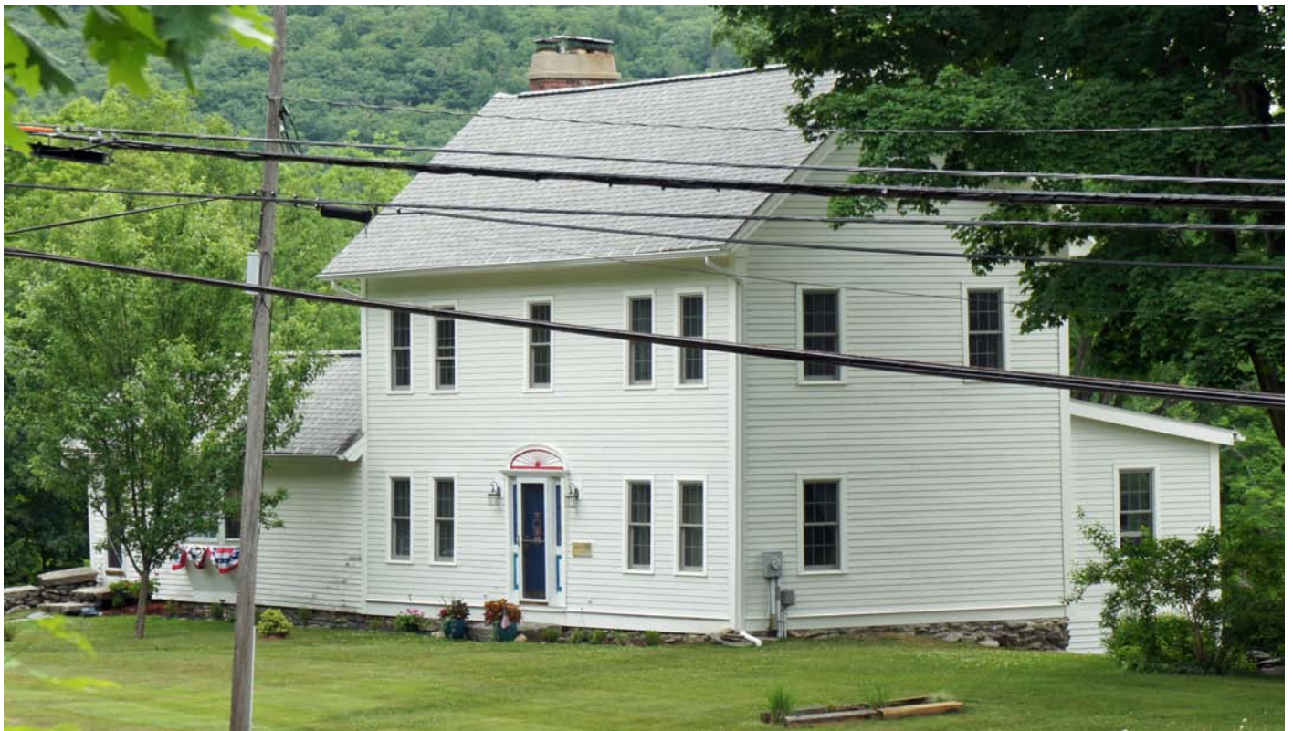
Above, View From Mountain House Foundation across Mountain Rd. of the old Bowling Alley Tea House, Currently a Private Residence