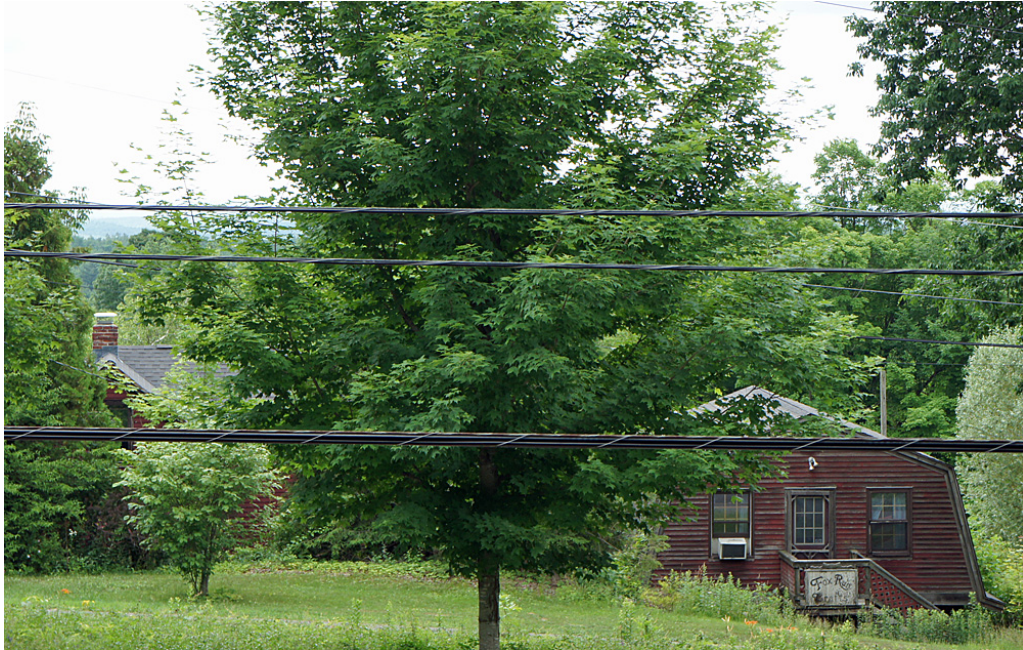
Above, View From Mountain House Foundation, across Mountain Rd to the Top of Gregory Rd. Where the Grand View Once Stood