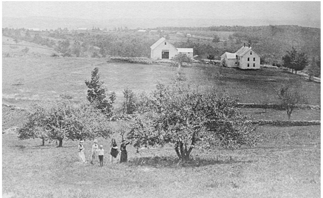
View East from Bowling Alley Tea Room circa 1890